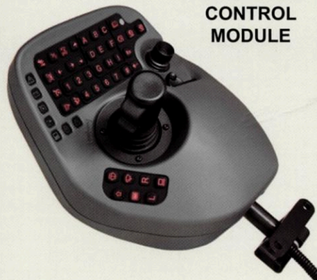
with Hall effect controls